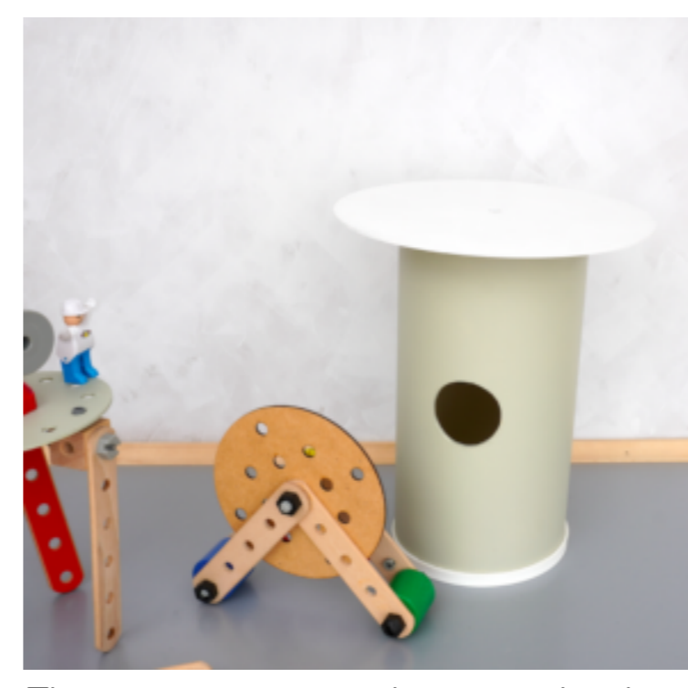
These spacers seen here as wheels are also used in Addi the chair .