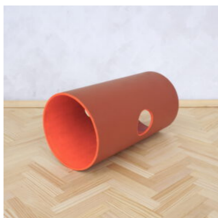
We have a couple more use cases for this part in stock. So stay tuned for more.