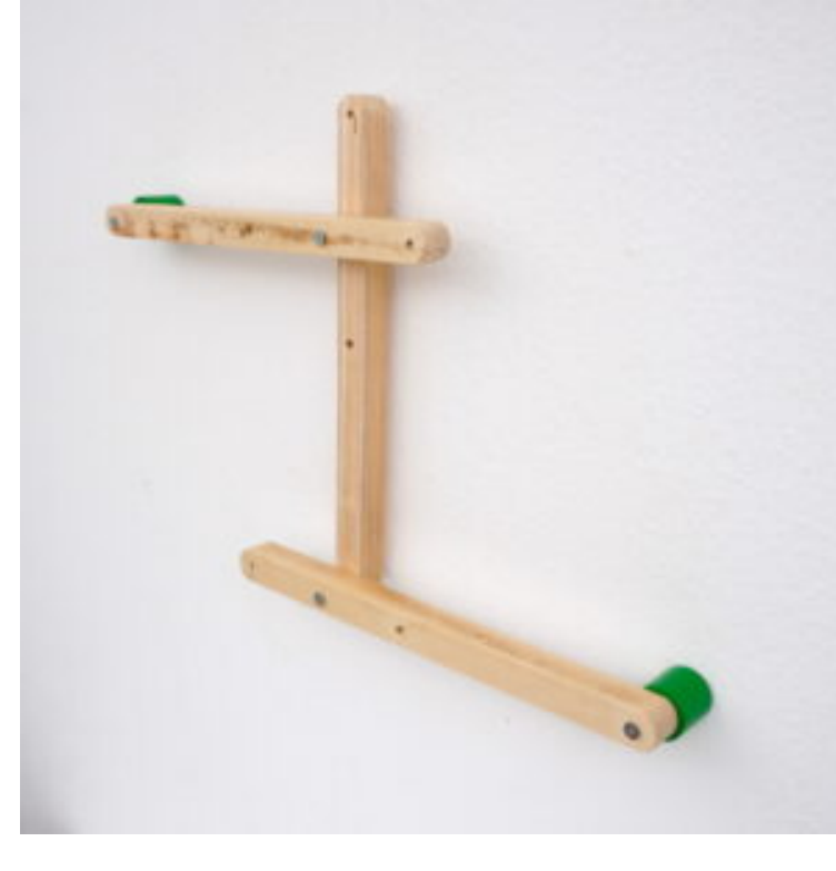
Pic 8. Click on image to enlarge.